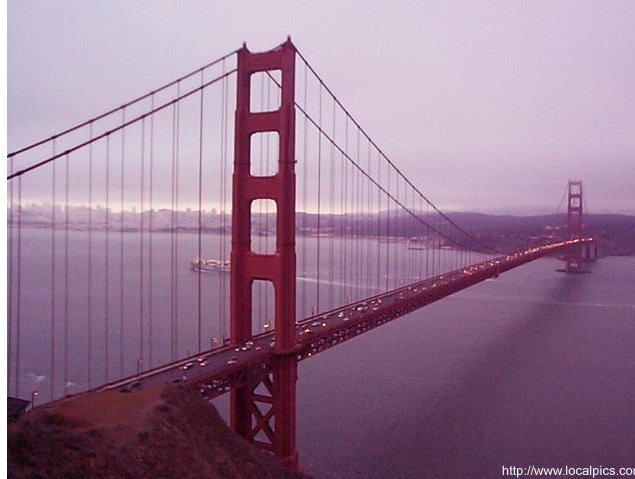
Figure 15 Photo of the Golden Gate Bridge, San Francisco, California

Suspension bridge superstructures are generally very light relative to their span length, which leads to structures that may be very flexible. The vertical stiffness can generally be controlled by the size of and tension in the main suspender cables. However, it is common to provide a lateral stiffening truss under the deck to avoid excessive excitement of the superstructure under wind or seismic loadings. The first Tacoma Narrows Suspension Bridge illustrated the pitfalls of providing the lightest superstructure possible based on strength design while not considering the possible harmonic effects induced by lateral wind loads. The structure collapsed due to the harmonic frequency set up during a period of only moderately high winds.