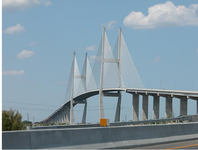
Figure 11 Photo of the Sidney Lanier Bridge over Brunswick River, Brunswick, Georgia

A-towers have inclined legs that meet at the top of the tower. The stay cables are usually in a plane that parallels the slope of the tower legs. From a detailing standpoint, the edge girder anchorages are more complicated since they intersect the edge girder at an angle. Moreover, because every stay cable intersects the edge girders at a slightly different angle, exact repetition of anchorage geometry is not possible. There have been instances where steel edge girders have been fabricated with sloped webs in an effort to simplify the anchorage details, but there is some increase in fabrication cost for the sloped edge girders. The inwardly sloped cable planes exert compression into the superstructure in both the longitudinal and transverse directions. The sloped cables provide some additional torsional stiffness, which is particularly important on narrow and slender superstructures. In many cases the center-to-center spacing of the edge girders needs to be increased so that the sloped cables do not infringe upon the vertical clearance envelope required to pass highway traffic.