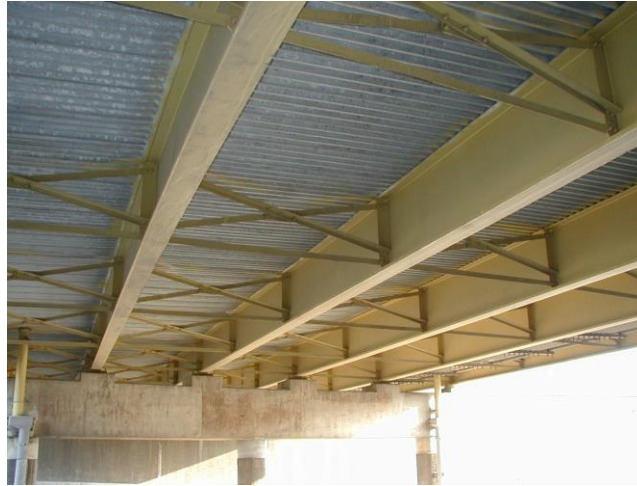
Figure 1 Photo of a typical multi girder system with x-type intermediate cross frames and stay-in-place formwork used for constructing the deck slab

There are several reasons that through girder bridges are not commonly used for highway structures. The system results in two-girder structures, which are generally considered fracture critical, meaning that the failure of one of the main girders could lead directly to the failure of the entire bridge. The main girders cannot be made composite with the bridge deck, meaning that the deck offers no strength benefit to the girders. Finally, the top flanges of the girders in the compression regions are braced only at the floorbeam spacing, rather than full length as would be the case for a composite deck girder bridge. This will require additional steel in the top flanges of the girders because of the strength reductions resulting from the unbraced length.