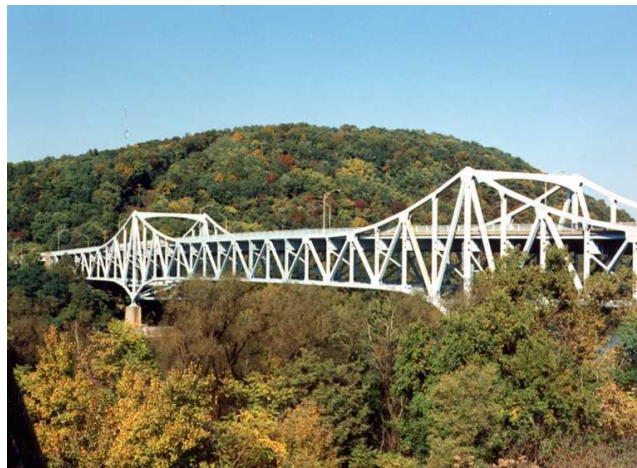
Figure 5 Photo of the Glenwood Bridge over Monongahela River, Pittsburgh, Pennsylvania

Half-through trusses carry the deck high enough that sway bracing cannot be used above the deck. Much of the previous discussion regarding through trusses applies to half-through trusses. It is very difficult to design a half through truss if the chosen truss type does not have verticals. Without verticals, the deck must be supported from diagonal members away from the joints. This condition results in significant bending stresses in the truss members, which are generally not efficient in carrying bending, thus resulting in inefficient member designs for the diagonals. Many of the recent trusses designed in the United States have been designed without verticals to achieve a cleaner and more contemporary appearance, thus minimizing the use of half-through trusses.