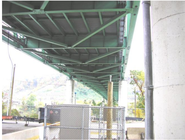
Figure 6 Photo showing a typical stacked floor system

commonly been used for the stringers since they can efficiently span the normal panel lengths used for trusses.