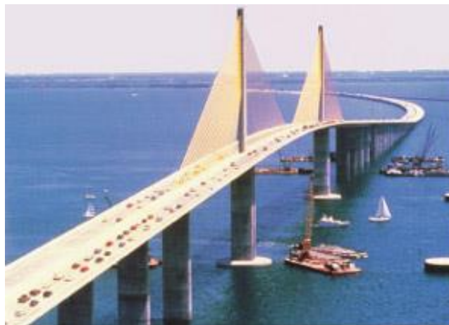
Figure 14 Photo of the Sunshine Skyway Bridge, Tampa Bay, Florida

Single column towers have been used on a few cable-stayed bridges. These towers consist of a single column in the center of the bridge with a single plane of stay cables down the center of the bridge. The single plane of cables offers some economy in cable installation and maintenance. However, the transverse beams supporting the superstructure at each anchorage location are designed as cantilevers in both directions and will be somewhat heavier than beams supported by two cable planes at the outside edges of the bridge.