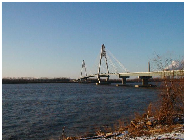
Figure 12 Photo of the William H. Natcher Bridge over Ohio River near Owensboro, Kentucky

A-towers have inclined legs that meet at the top of the tower. The stay cables are usually in a plane that parallels the slope of the tower legs. From a detailing standpoint, the edge girder anchorages are more complicated since they intersect the edge girder at an angle. Moreover, because every stay cable intersects the edge girders at a slightly different angle, exact repetition of anchorage geometry is not possible. There have been instances where steel edge girders have been fabricated with sloped webs in an effort to simplify the anchorage details, but there is some increase in fabrication cost for the sloped edge girders. The inwardly sloped cable planes exert compression into the superstructure in both the longitudinal and transverse directions. The sloped cables provide some additional torsional stiffness, which is particularly important on narrow and slender superstructures. In many cases the center-to-center spacing of the edge girders needs to be increased so that the sloped cables do not infringe upon the vertical clearance envelope required to pass highway traffic.