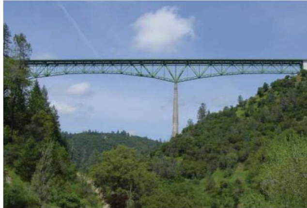
Figure 3 Photo of the Foresthill Bridge over American River's North Fork, Auburn, California

Through trusses are detailed so that the bridge deck is located as close to the bottom chord as possible. The bottoms of the floorbeams are normally located to line up with the bottom of the bottom chord. Through trusses are generally used when there is a restricted vertical clearance under the bridge. The depth of the structure under the deck is controlled by the depth of the floor system and can therefore be minimized so that the profile can be kept as low as possible. For shorter spans, the minimum depth of the truss may be controlled by the clearance envelope required to pass traffic under the sway/portal frames. The trusses must be spaced to pass the entire deck section inside the truss lines. It is generally not feasible to widen a through truss structure without adding a parallel truss to the original two truss lines.