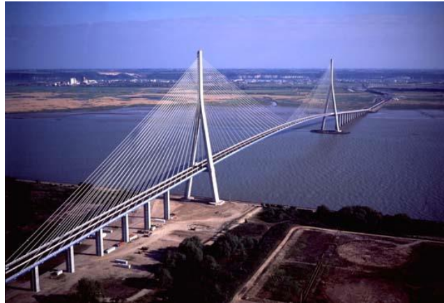
Figure 13 Photo of the Normandy Bridge over Seine River near Le Havre, France

legs. The stay cables are then anchored in the vertical column. Every stay cable intersects the edge girders at a slightly different angle so that exact repetition of anchorage geometry is not possible. The advantages and disadvantages discussed for the cables are similar to those previously discussed regarding A-towers. Achieving the desired clearance envelope for traffic may be more critical for the inverted Y-towers, possibly requiring even further widening of the superstructure since the inward cable slopes are more significant.