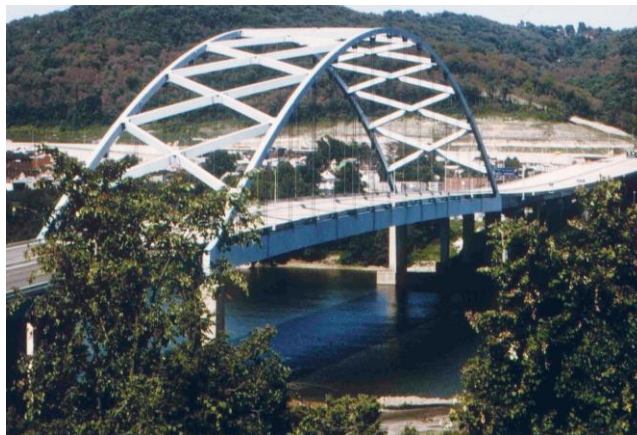
Figure 9 Photo of the I-470 Bridge over Ohio River, Wheeling, West Virginia

Tied arches are generally more effective in cases where deep foundations are required or where high piers may be required to achieve a desired clearance under the bridge, such as a long span crossing a river where a navigation clearance envelope must be provided.