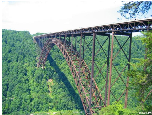
Figure 8 Photo of the New River Gorge Bridge near Fayetteville, West Virginia

Deck arches are usually used when crossing deep valleys with steep walls. Assuming that rock is relatively close to the surface, the arch foundations can then remain relatively short, effectively carrying both vertical loads and horizontal thrusts directly into the rock. The foundation costs increase significantly when deep foundations are required. Occasionally, there are site constraints that dictate placing the foundations closer to the deck profile, such as a desire to keep the bearings for the arch above the high water elevation at the site. In such cases, half-through arches may better satisfy the design constraints.