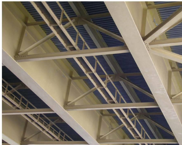
Figure 2 Photo of a typical girder substringer system showing a stringer sitting on top of cross frames

One variation of the multi-girder system is the girder substringer system. This arrangement is generally used on wider bridges with relatively long spans. As discussed earlier, fewer girders in the cross section will result in greater overall economy in the superstructure design. When the span lengths exceed approximately 275 feet, it is often economical to use a girder substringer arrangement. This system uses several heavy girders with wider girder spacing. Truss crossframes, which in many cases look like large K-frames, are used between the main girders with the rolled beam stringers supported midway between the main girders.