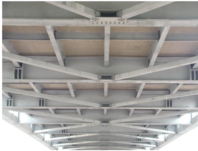
Figure 7 Photo of a typical framed floor system

Framed floor systems use a series of simple span stringers that frame into the floorbeam webs. When faced with depth restrictions, framed systems serve to reduce the overall depth of the floor system by the depth of the stringers.